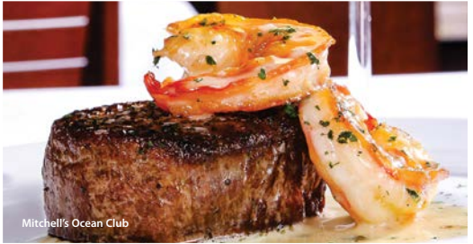
Mitchell's Ocean Club