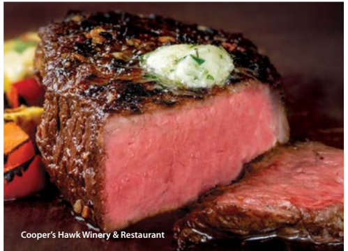
Cooper's Hawk Winery & Restaurant