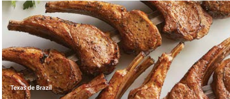
Texas de Brazil