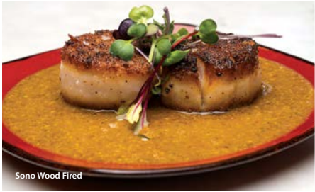
Sono Wood Fired