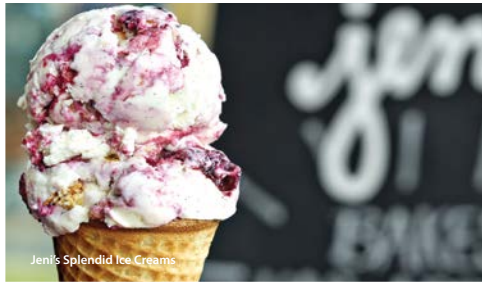
Jen's Splendid Ice Creams