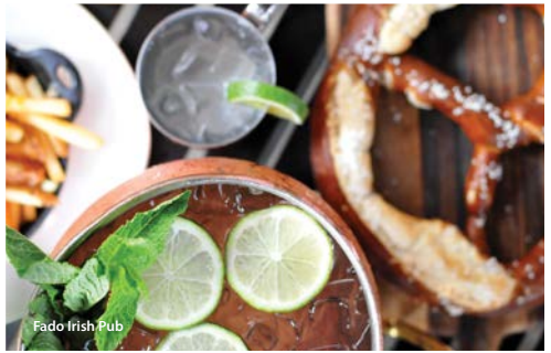
Fado Irish Pub